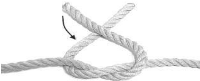
Right over left and under