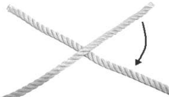
Left over right and under

This knot is used to join two ropes of equal thickness such as cord or parcel string. It is also used in first aid for tying slings and bandages as the knot lies flat and is easy to undo. A Reef Knot is not suitable for thick rope as it will loosen and come undone very easily.